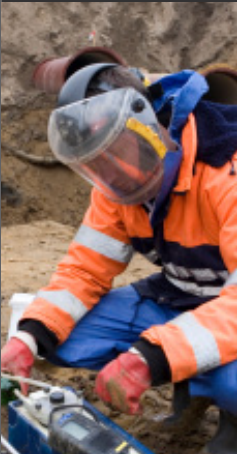
Contaminated Land Management