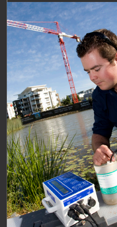
Monitoring & Assessment