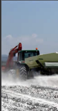
Acid Sulfate Soils