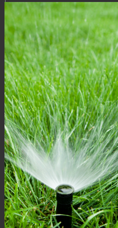
On-Site Wastewater Management